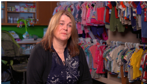
Carol Butler Crisis Pregnancy Centre