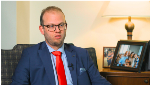
MP Arnold Viersen