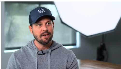
Seth Dillon Babylon Bee